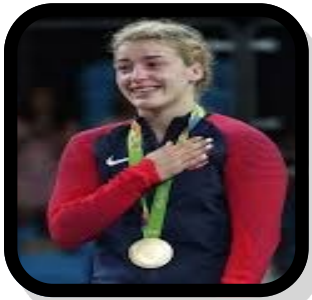
Session 7 -