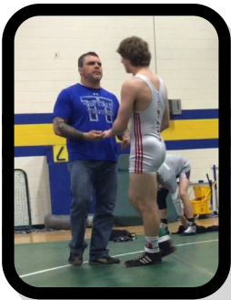
Session 1 - Starting a Small Town Program, Running a Year Round Program , Business of Running a Program

Never had a losing season in 18 years of MD high school coaching