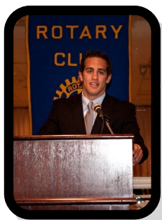
Session 5 - Wrestling Mindset (Predator vs Prey, Building a More Aggressive Wrestler)