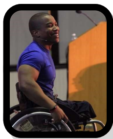
Session 3 - Motivational Speaking