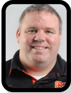
Session 2 - Building/ Running a HS Pro- gram, Season and Practice Planning