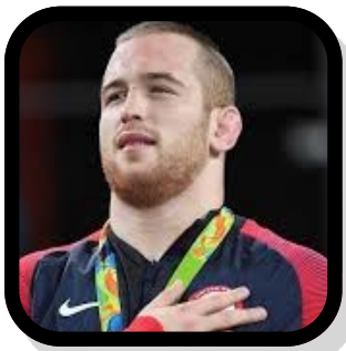
Session 7 -